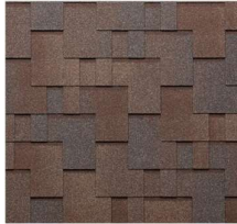
522 - Arabica