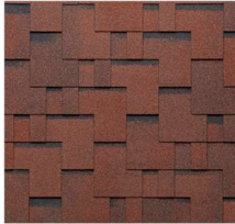
512 - Tiziano Red