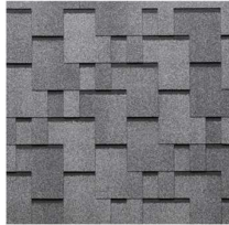
554 - Granite