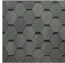
569 - Granite