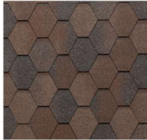
522 - Arabica