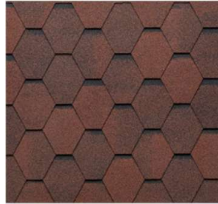
512 - Tiziano Red