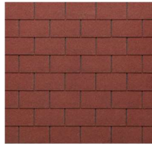
503 - Coppery Red