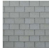
053 - Light Grey