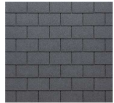
061 - Slate Grey