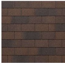
547 - Woodbrown