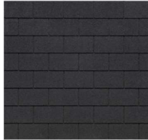
060 - Black