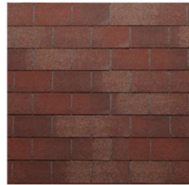
002 - Tone Red