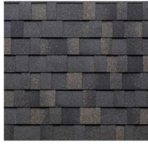
167 - Ancient Stone