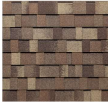
129 – Wood Shake