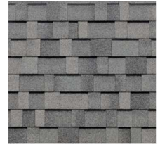
553 - Light Slate