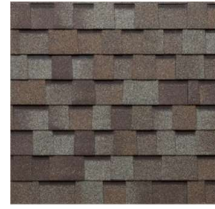
548 - Natural Stone